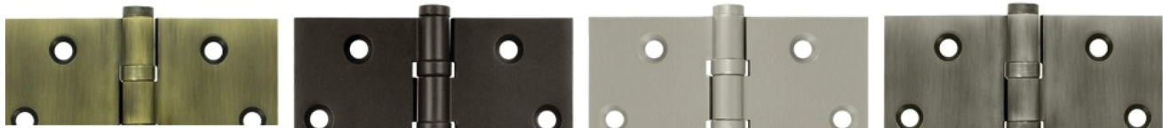
US5/609 Antique Brass