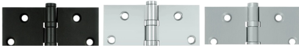
US19/622 Paint Black